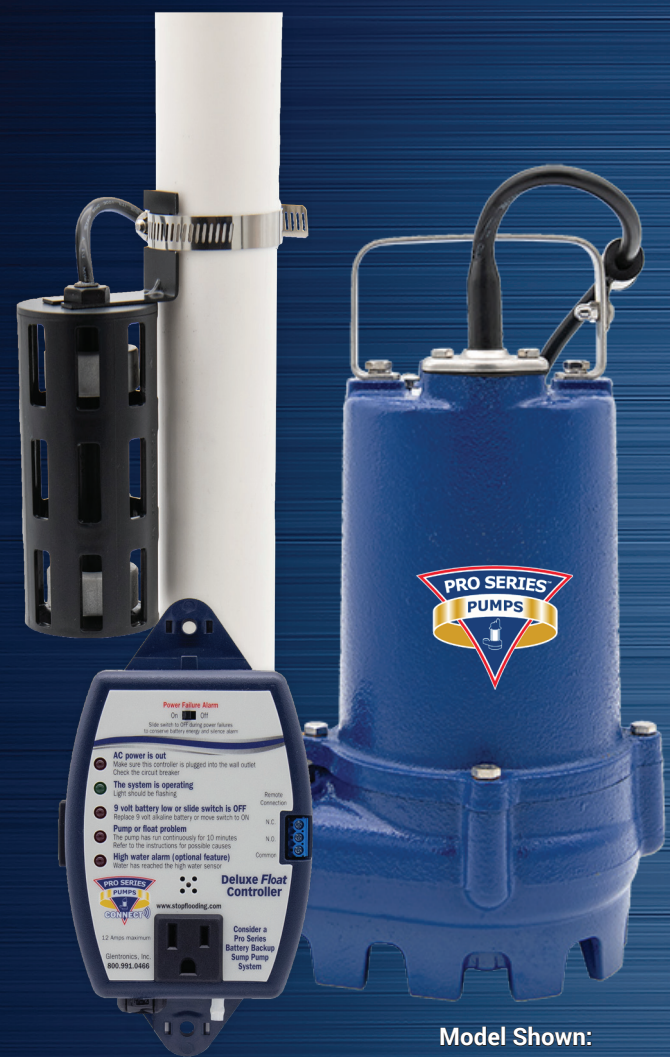
Model Shown: S2033-DFC2