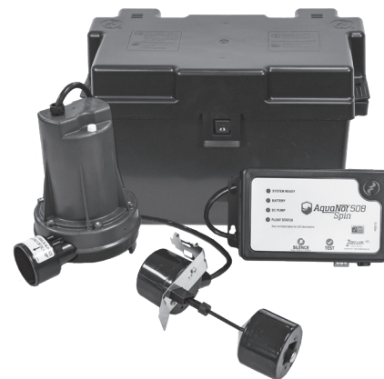
AquaNot® Spin 508 system

* If optional high water reed sensor is being used