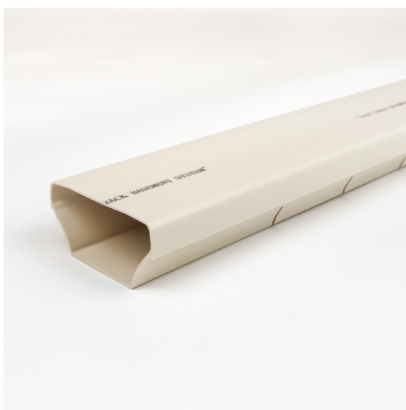
Fast Track Channel (6ft Main Sections) Item# FT4449-90FT