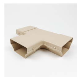
Tee Item# FT7779