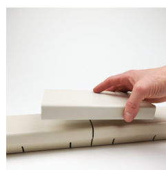
Snap Joint Item# FT2229