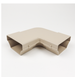
Universal Corner Item# FT5559