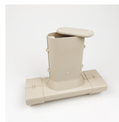
Inspection Port Item# FT6669