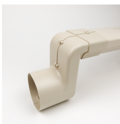
Sump Drop Item# FT9999